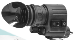
Portable Head-Mounted Display HMD-800/HMD-800-MOD (streams video directly from the device)