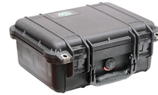
Hard Waterproof Case