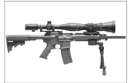
Clip-On (In-Line) Sight