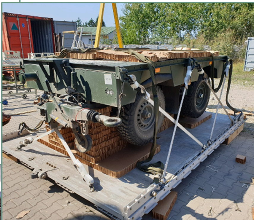
Trailer prepared for airdrop on airdrop platform type PDS V 108" 12 ft