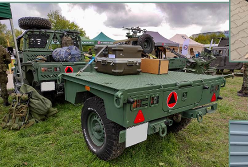
Trailer with AERO vehicle