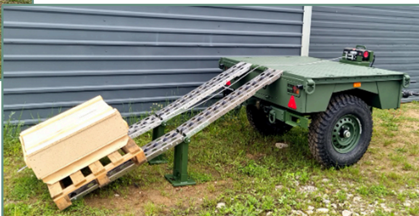
Trailer with self-loading kit