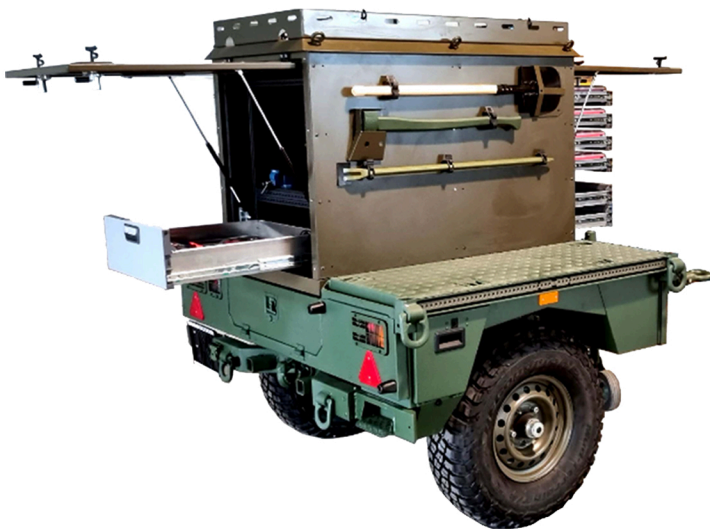
Trailer with workshop and rescue module for AERO vehicles